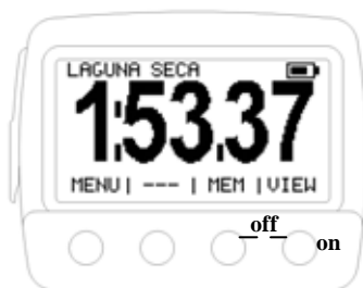
Figure 2: MyChron Light TG display

First of all, please switch on MyChron Light TG pressing the right rubber pushbutton (to switch it off You have to press the two right rubber pushbuttons). All digit numbers are set to zero. In order to get correct data from Your lap timer, You have to configure it. To start configuration, please press MENU pushbutton: configuration menu is displayed. For further information concerning all configurable functions, please refer to the following table: