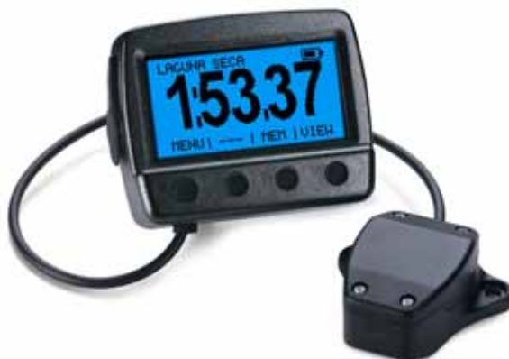
Figure 1: MyChron Light TG and its IR receiver